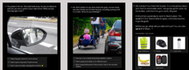
Interactive story screenshots

The concept was prototyped using an online platform (Typeform) and personalised based on road user role/s. To test individualised versus group personalisation, a second version was built and personalised with user information such as name and location.